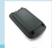
Battery Cover (for 2300mAh)