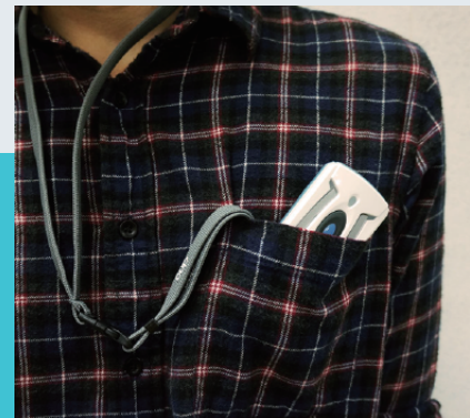
Compact Form Factor