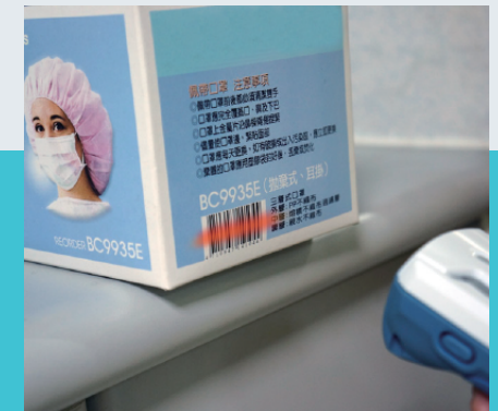
FuzzyScan 3.0 Technology