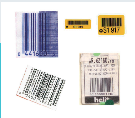
No Worry for Poor Barcodes