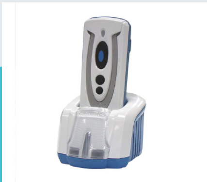
Smart Cradle Solution

Built with the advanced FuzzyScan 3.0 imaging technology, Cino Bluetooth pocket scanner is capable of reading most popular 1D, Linear-stacked, PDF417, GS1 DataBar and Composite barcodes. It can read 13 mil UPC/EAN barcode up to 24" as well as 3 mil high density barcode.