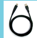
Cable: USB PS/2 RS232 Micro USB