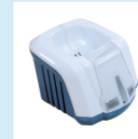
Smart Cradle Charging Cradle