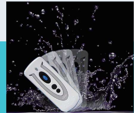
Rugged and Durable