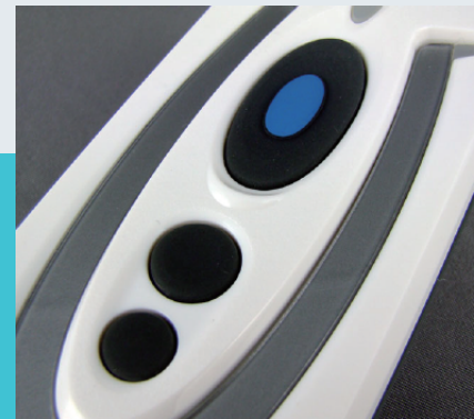
User-friendly Function Keys