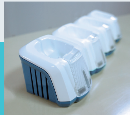
Multi-slot Cradle Solution