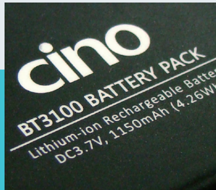
Efficient Power Management