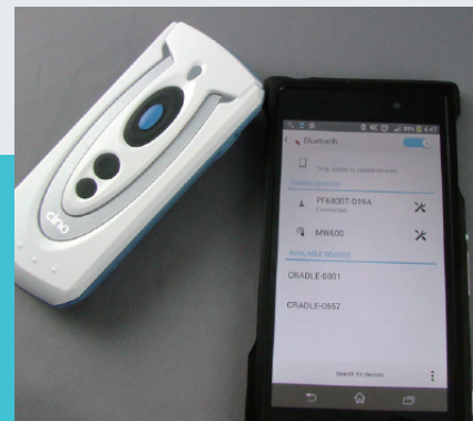
Bluetooth v 4.0 Technology