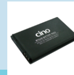
Battery: 1150mAh 2300mAh