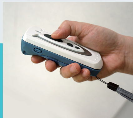
Ergonomic Outer Shell

Cino Bluetooth pocket scanner provides several radio link modes to communicate with most host devices. It not only can connect to non-Bluetooth hosts via working with smart cradle in PAIR and PICO modes, but also can connect with most of mobile devices, such as smartphones, tablets and notebooks running on Windows, Android or iOS. via HID or SPP mode. The newly-designed HID mode allows you to pair the scanner with mobile devices simply and quickly without entering the passkey.